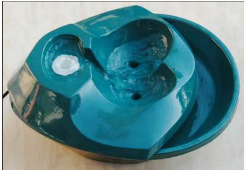
The Corinna Flowform