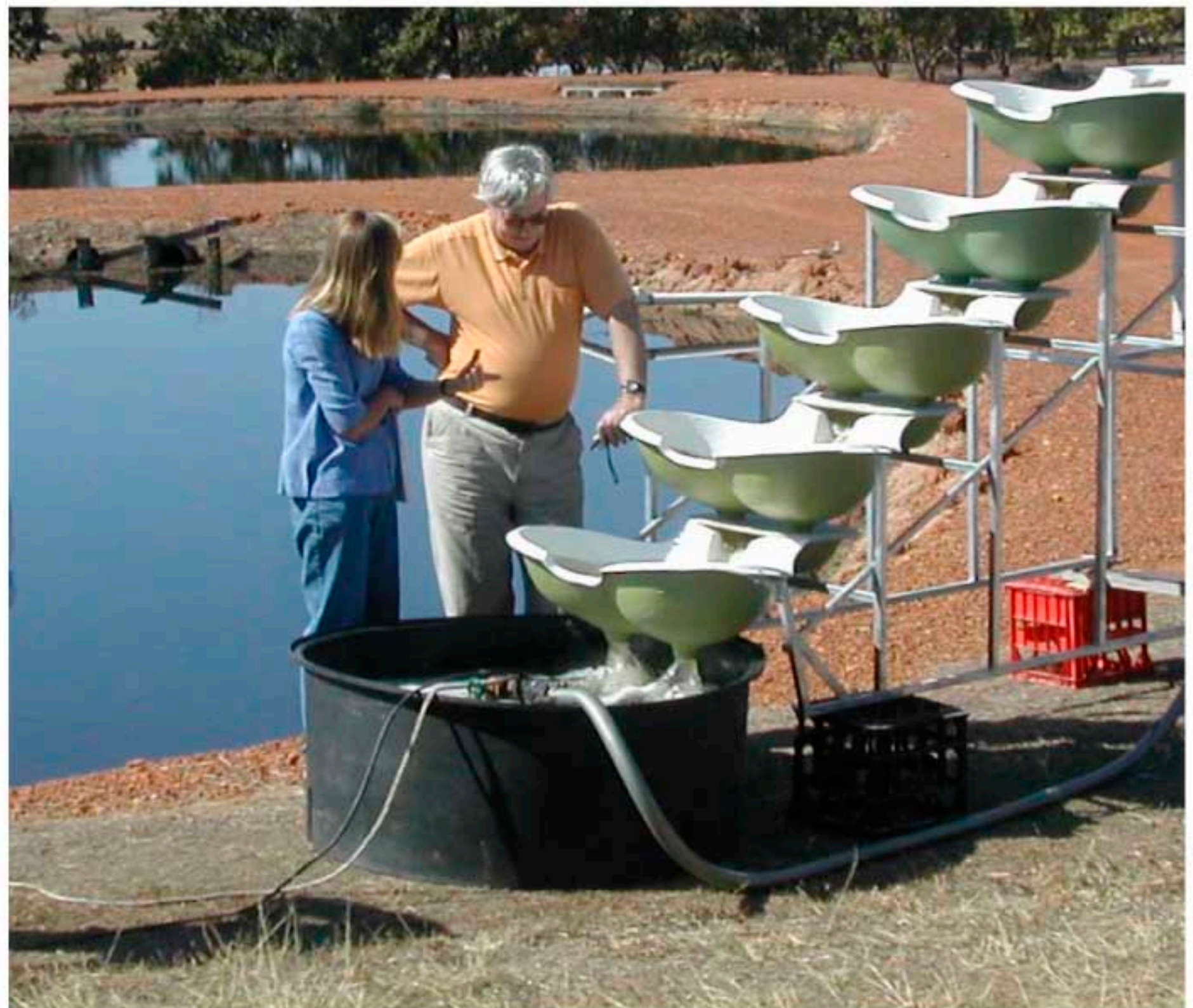
Vortex 5 kit with 250 litre tank and submersible pump

Five Vortex Flowforms would be equivalent to two sets of seven Miroma Flowforms. It has recently arrived from England, and is the only Vortex mould in the Southern Hemisphere.