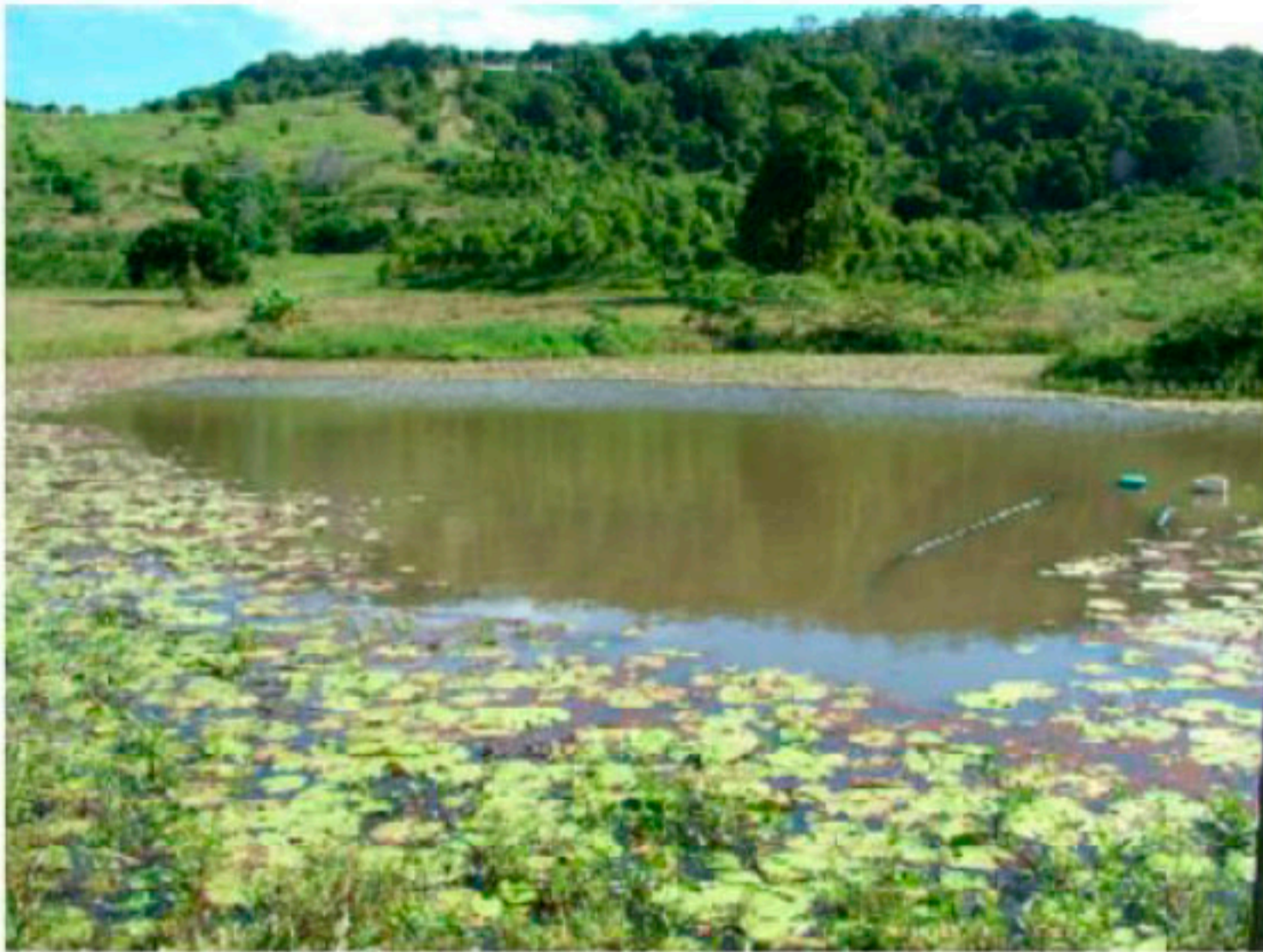
Regenesis Farm Dam - Mullumbimby NSW

The Concept of digging a hole in the ground and storing pristine clean water within, is really a bit of a pipe dream. What with, high water temperatures, lack of plant species to form any type of Aquatic symbiosis, no flow or movement, it really is no wonder that most of these "turkey nest" dams are a bit of a failure.